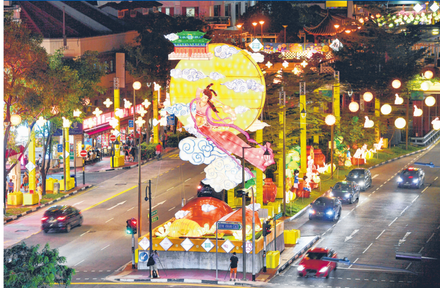
Chinatown is all decked out for the Mid-Autumn Festival, aglow with 900 lanterns and a towering centrepiece of Change, the Chinese goddess of the moon. The 12m-tall display opposite Chinatown Point shows Change soaring to a palace against the backdrop of a full moon. Lanterns shaped like mooncakes and jade rabbits line the other streets. The light-up will be on until Oct 5. The festival falls on Sept 21.