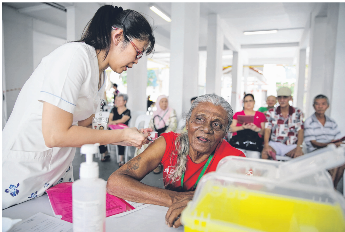
A vaccination session by Tan Tock Seng Hospital in 2015. The flu jab study, by the National Centre for Infectious Diseases and Tan Tock Seng Hospital, had 200 participants aged 65 and up. Its findings could help determine how often people here should get a flu jab.

Researchers found getting vaccinated twice a year may better protect elderly S'poreans